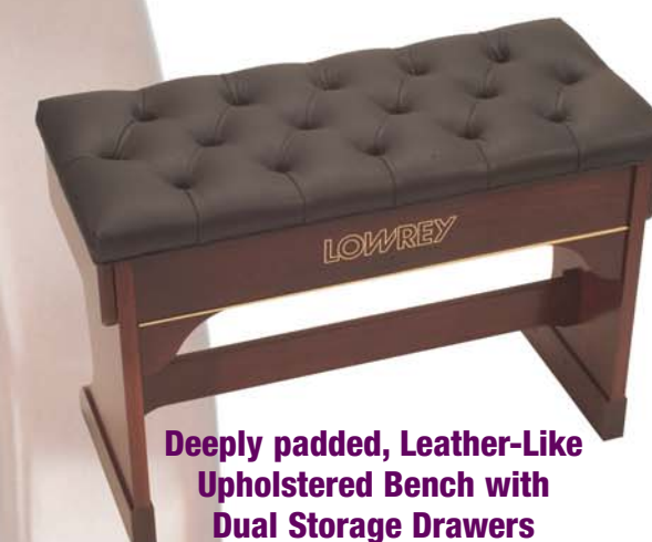
Deeply padded, Leather-Like Upholstered Bench with Dual Storage Drawers