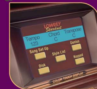
Color Touch Display