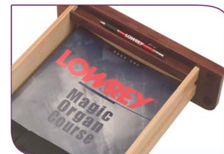
Holds full-size sheets and folios

The Stardust's bench offers several convenient features. The thick, comfortable padding makes those long sessions playing the organ even more enjoyable. Adding to the splendid design are drawers on each end that provide generous space for sheet music and music book storage; large enough to hold your favorite 9"x12" folios. One side even adds a storage area for 3.5" disks!