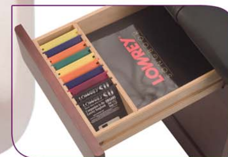
Book and Disk Storage

Lowrey maintains a policy of continuous improvement and reserves the right to change specifications without notice.