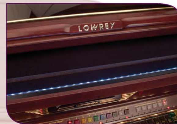
Lighted Music Rack Extender

Lowrey's exclusive Music Rack Extender brings printed music closer to the seated player. Just slide the extender drawer out and lift the secondary music rack from its storage spot and insert in it the slot on the shelf. With the secondary rack in place the shelf slides in and out for adjustment. The extender's ideal location allows the rolltop cover to be opened and closed with the secondary rack in place. Press the Music button and a row of lights illuminate the secondary music rack. Close the extender shelf and the lights go out while at the same time turning on the lights for the primary wood music rack.